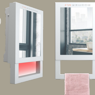
QUADRO VISIO with mirror and towel rail